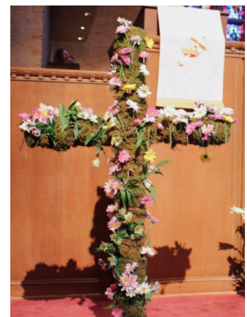
Second's 2015 Easter Flowering of the Cross