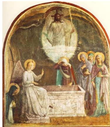
Fresco of the “Resurrection of Christ and the Women at the Tomb” by Fra Angelico (1395-1455).

from www.presbyterianmission.org/ministries/worship/resurrection-lord-easter/