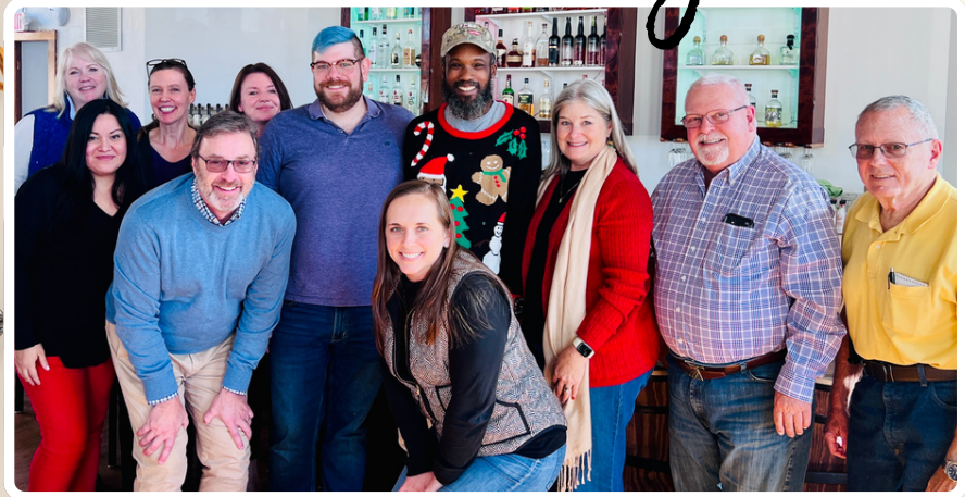
FROM THE STAFF AT SECOND PRESBYTERIAN CHURCH!